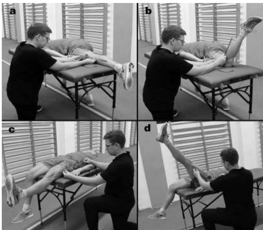
Figure 2. Positions used for measurement of knee flexion (a, b) and hip flexion (c, d) range of motion.

The length of quadriceps muscle was tested in prone position (Figure 2c, 2d). The goniometer was placed on the lateral epicondyle. The stationary arm direction was greater trochanter and moving arm direction was malleolus lateral. The examined bent knee joint in a maximal straight hip joint. The second leg knee was next to the massage table on the floor for better stabilization. In our study, we tested rectus femoris muscle, semitendinosus, semimembranosus and long head of biceps femoris. From the point of view of anatomy, these muscles move in more than one joint and if there are some tissue restrictions, the problem may also arise in the joints where they move. The length of these muscles can be tested by ROM in hip or knee joints.