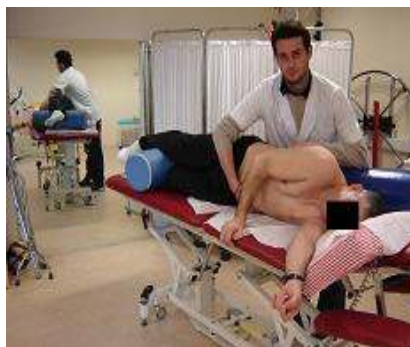
Picture 1. Application of respiratory exercises into a CP patient during the 12-week physiotherapy program.